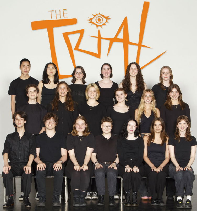
2024 YEAR 12 THEATRE ARTS STUDENTS