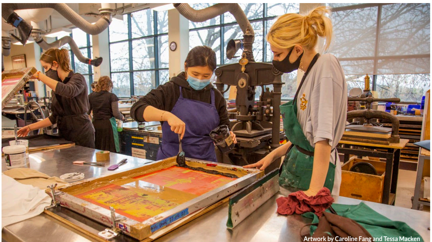
Artwork by Caroline Fang and Tessa Macken

The Victorian Certificate of Education (VCE) is generally taught in Year 11 and 12, however some students at VCASS commence their VCE studies in Year 10. All VCE studies are organized into units, (each subject typically consists of four semester units). A unit comprises a set number of Learning Outcomes, (usually two or three). Units 3 and 4 of a subject must be studied in sequential order, whereas Units 1 and 2 can be mixed and matched. Students are not required to complete all the units of a subject as part of the VCE course, which means they are able to change their subject choice between Years 11 and Year 12. On completing a unit, a student receives either an S (Satisfactory) or N (Non-satisfactory) result. If a student does not intend to proceed to tertiary education, an S result is all that is required to graduate with the VCE.