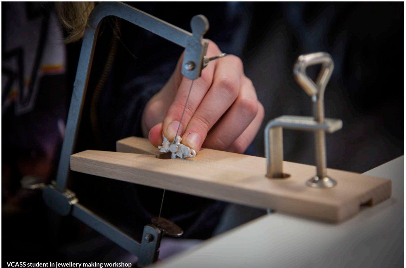
VCASS student in jewellery making workshop