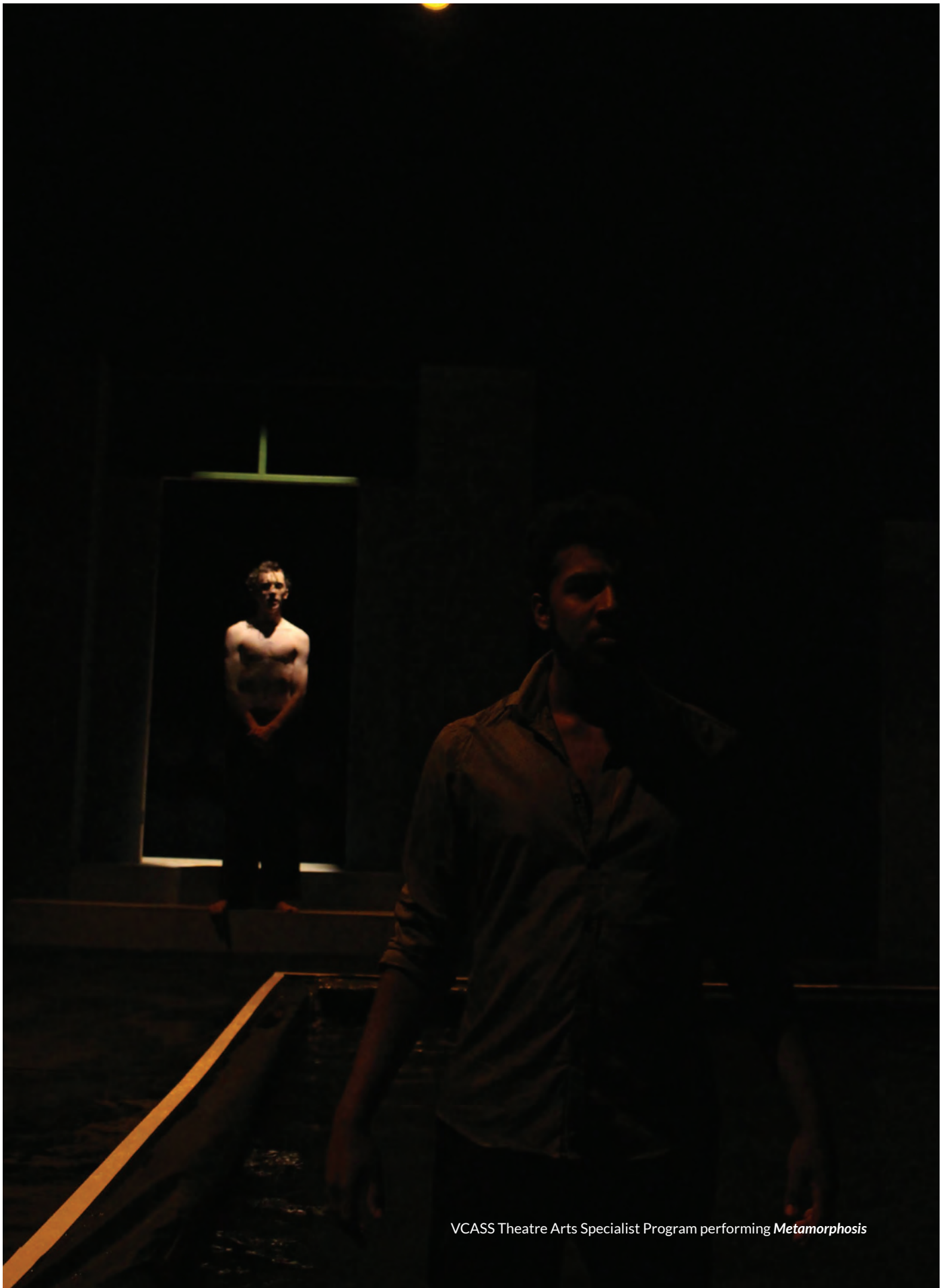
VCASS Theatre Arts Specialist Program performing Metamorphosis