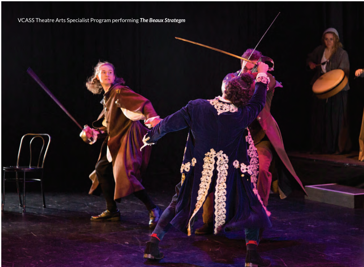
VCASS Theatre Arts Specialist Program performing The Beaux Strategem